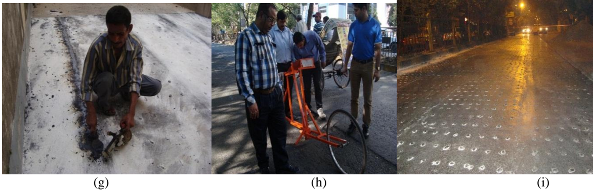
Fig.3 Commercial Field Trial of BJPF (a) Cooking of ingredients in vat (b) Cleaning of the road surface (c) Application of tack coat (d) Laying of BJPF roll in the road surface (e) Transfer of mastic over BJPF (f) Placing of anti-skid agents on the masticated surface (g) Thermo setting of the joints (h) Analysis of road surface roughness by Merlin Tester (i) Smooth traffic movement on the new masticated road.