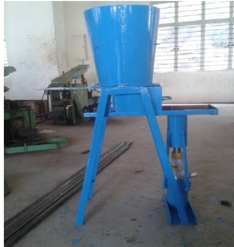
Fig.9. Briquetting Machine

Fig.9. shows the Briquetting machine which can be easily disassembled and hence it is portable. A rigid frame provided for jack supports the whole unit.