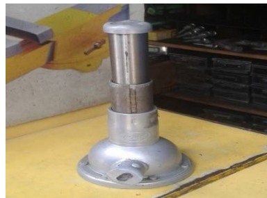
Fig.7. Telescopic jack

3. COMPRESSING UNIT: It consists of a Telescopic jack, cylinder and a piston. The jack drives the piston inside the cylinder, here we are using a jack which upon rotation move the piston in and out of the cylinder. The piston and cylinder are machined to the close dimensional tolerance so that the piston moves easily inside the cylinder. The grinded raw materials are put in to the cylinder, these materials inside the cylinder are compressed into briquettes upon the application of force by the jack. Thus formed briquettes are taken out by pulling the plate at the top of the cylinder.