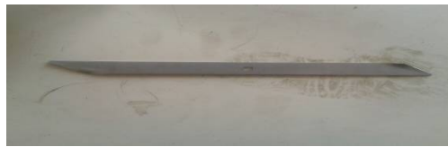
Fig.2. Grinding blade

Fig.2. shows motor, here we have used an AC motor of 750Watts, 230 Volts and 18000 RPM (with no load). And we have used a regulator to control the speed of the blade which is connected to the motor, as required on the amount of raw material to be grinded inside the hopper. The motor is placed on the circular disc with the legs as shown. Motor specification: Ac motor 750 Watts, 230 Volts and 18000rpm, weighs 1.8Kg.