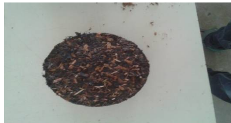
Fig.10. Briquette with coffee husk

Fig.10. shows the briquette, which is made using sawdust, dry leaves and coffee husk. Here we have not used any binder the coffee husk itself acts as a binder under pressure. The rise in temperature recorded in bomb calorimeter is 0.72 °C and hence we got the calorific value, C_v = 4789.17 Kcal / kg.