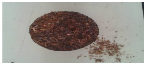
Fig.11. Briquette with starch

Fig.10. shows the briquette, which is made using sawdust, dry leaves and coffee husk. Here we have not used any binder the coffee husk itself acts as a binder under pressure. The rise in temperature recorded in bomb calorimeter is 0.72 °C and hence we got the calorific value, C_v = 4789.17 Kcal / kg.