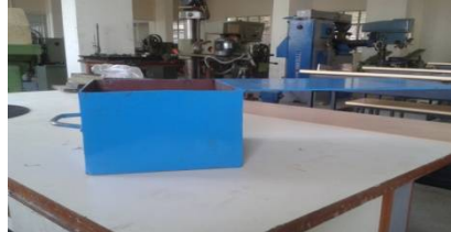
Fig.6. Sliding member

2. CARRIER UNIT: This unit consists of guide ways and sliding member. Fig.5. shows guide way, which is used to guide the sliding member through it, so that the sliding member shown in Fig.6. can move easily in the specified path to carry the grinded raw materials from the hopper to the cylinder (compressing unit). The guide way is attached to the thick hollow disc to which the legs are attached to that act as a support. Sliding member is rectangular box, it is used to carry the raw material from hopper to the cylinder.