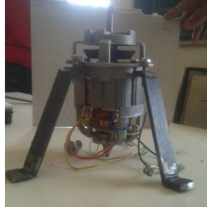
Fig.2. Motor with legs

Fig.2. shows motor, here we have used an AC motor of 750Watts, 230 Volts and 18000 RPM (with no load). And we have used a regulator to control the speed of the blade which is connected to the motor, as required on the amount of raw material to be grinded inside the hopper. The motor is placed on the circular disc with the legs as shown. Motor specification: Ac motor 750 Watts, 230 Volts and 18000rpm, weighs 1.8Kg.