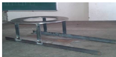
Fig.5. Guide ways

Fig.4. shows sieve plate through which the grinded raw material passes and collected in the sliding member. The size of sieve 5mm. This dimension is taken by referring journals, which says that the grain size between 3mm to 5mm is best suited for good compactness. Here the sieve plate made by cutting the sieve in circular shape and placed in between the two thin hollow disc with nut and bolt arrangement.