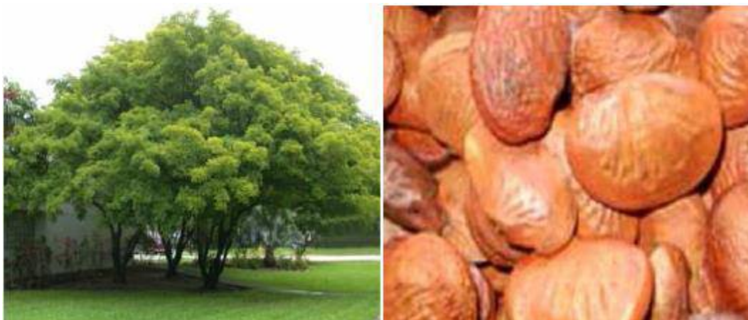
Fig. 1: Karanja Tree and seeds [13]

Vegetable oils are produced from numerous oil seed crops. While all vegetable oils have high-energy content, most require some processing to assure safe use in internal combustion engines [12]. Karanja tree and seeds can be seen as shown (Fig. 1)