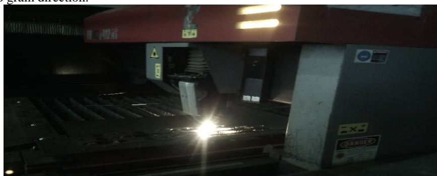
Figure. 1 Amada LCG 3015

Amada LCG 3015 CO 2 LASER cutting machine of 4KW at 1.5 Bar gas pressure, N 2 gas 4.0 nozzle diameter, 85% duty cycle having continuous wave type mode and specifications shown in table 1 was used for cutting of AISI321 10 mm thickness, plate having dimensions 130mm*285 mm as shown in figure.1 with straight profile cut beside each side perpendicular to grain direction.