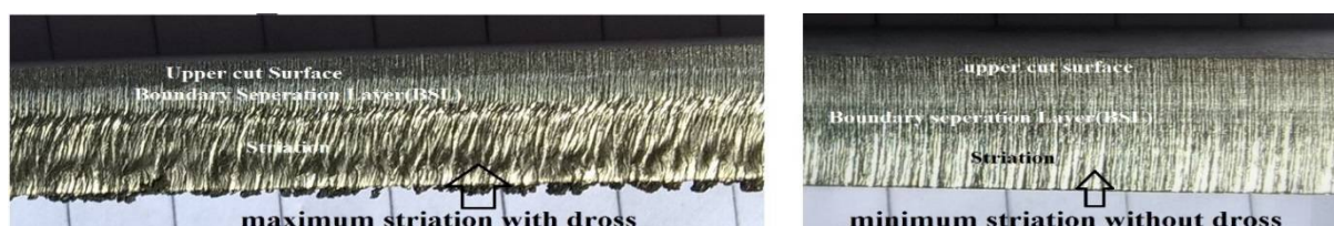
Figure 2 (a) maximum striation 2. (b) Cut of Optimum cutting parameter

The after the cutting is carried out surface is differentiated as upper cut surface, Boundary separation layer (BSL), striation are shown in figure 2. where measurement are taken.