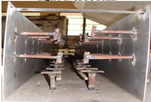
Figure-1: CSCC Beam