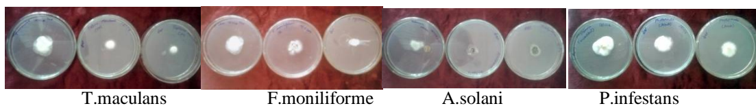
Photoplate 2:- Growth of pathogens on PDA media and microscopic examination