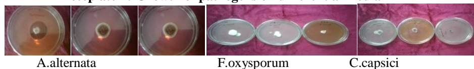
Photoplate 1:-Growth of pathogens on differential media

The isolated fungi were identified to the genus level and species which was possible on the basis of micro-morphological and macro-morphological characteristics using suitable media, slide cultures (obtained by inoculating micro fungi directly on a small square of agar medium) and the most updated keys for identifications.