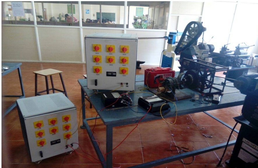
Fig 1.4 Assembled view