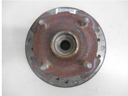
Fig 1.2 Metallic Brake disc

A disc brake is a type of brake that uses calipers to squeeze pairs of pads against a disc in order to create friction that retards the rotation of a shaft, such as a vehicle axle, either to reduce its rotational speed or to hold it stationary