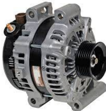
Fig 1.3 14.2V Lucas TVS Alternator

An alternator is an electrical generator that converts mechanical energy to electrical energy in the form of alternating current. A conductor moving relative to a magnetic field develops an electromotive force (EMF) in it.