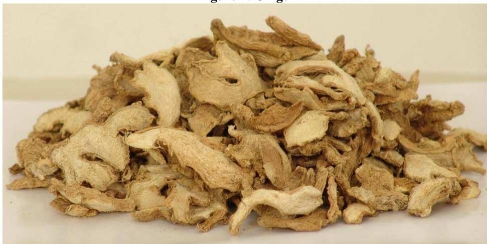
Figure 1: Ginger