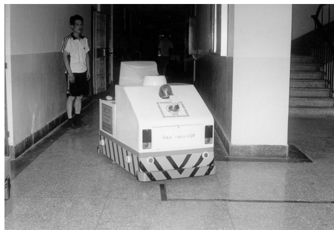
Figure Tainjin Institute of Technology's TUT-1 intelligent robot.

An excellent example of an intelligent robot is the TUT-1 shown in Figure and described by Cao8 in this proceedings. This intelligent robot can be guided using overhead lights using an omnidirectional vision system.