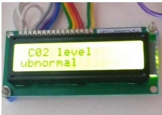
Fig 2 Gas Sensor Output

In this paper we have explained the design and implementation of a simple, reliable and cost effective automatic water level control circuit. This circuit can be mainly implemented in offices and buildings and can cover an area of 50-100m. For covering larger distances LAN based water level controller can be used but it can be expensive. RF based water level controllers are present in the market which cannot send serial data and are used for short distance purposes. It is observed that the offices and households are the main areas of water wastage. So, constant monitoring and control of water level in the overhead tank is required. It has no problem of wire breakage after the installation is complete. It can also be employed for water leakage, detection is find using the water level.