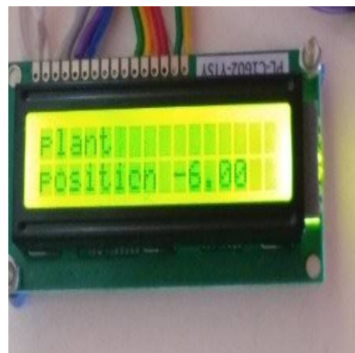
Fig 5 MEMS Sensor Output