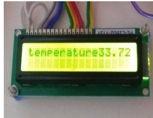
Fig 3 Temperature Sensor Output