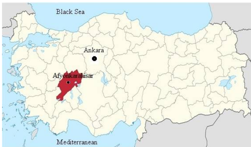
Fig. 1: The location of Afyonkarahisar on the map of Turkey