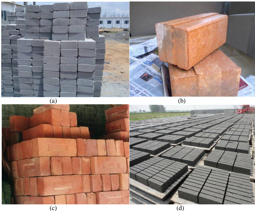
Fig 1. Masonry units (a) Fly ash bricks (b) Compressed soil block (c) Burnt clay bricks (d) Concrete blocks

Without assessing the performance parameters, analysing the energy criteria does not have a greater significance. If the chosen energy efficient materials, does not perform at least at par with the conventional materials, the energy analysis is of no use. The masonry units used are Burnt clay bricks, Fly ash bricks, Solid concrete blocks and compressed soil blocks.