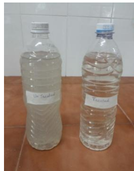
Fig. 3 Untreated & Treated Samples

The raw sewage samples was collected from anaerobic channel and then transferred to the reservoir. The wastewater collected from the reservoir for treatment and the treated wastewater from the outlet of the tank is shown below: