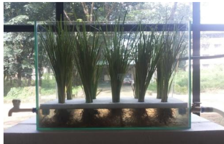
Fig. 2 Initial stage of varying load CW

The varying load constructed wetland can treat high load concentrations having higher depth. It is very efficient and economic technology for domestic waste water treatment. Since it is a varying load wetland with greater depth, deep rooted plants are mostly preferred. Being a hydroponic method, there were no ongoing fly, mosquito problems, bad smell and gas formation. In the initial stage 24 L of the raw sewage was given to the tank with an HRT of 5 days. After 5 days, the effluent is taken for the analysis of the physico-chemical parameters.