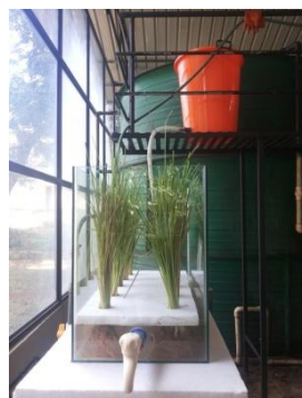
Fig. 1 Experimental Setup

The raw sewage collected from anaerobic filter unit was improved by passing through constructed wetland system. A pilot wetland system was constructed using glass sheet of 6mm thickness. The dimension of the tank was 0.7m X 0.35m X 0.5m (length x width x depth). The influent was supplied from a reservoir which was kept at the top to facilitate the vertical flow condition.