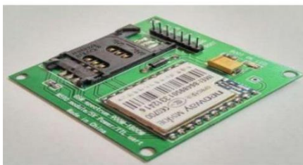
Fig 3: GSM module