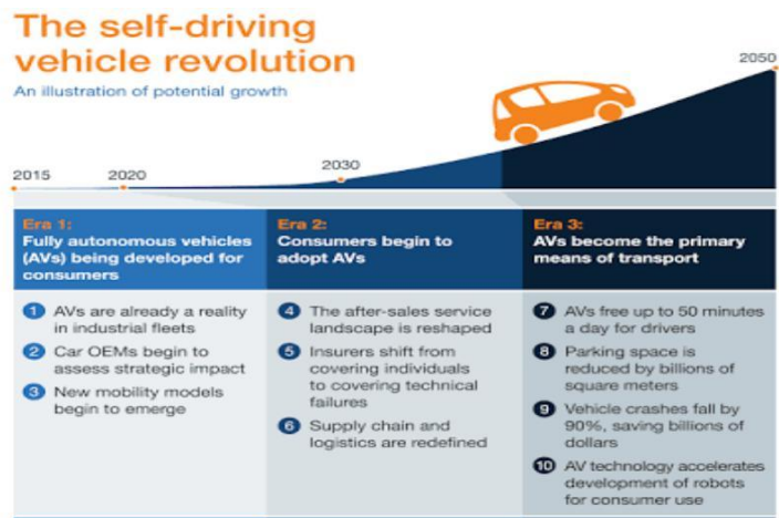
Fig 8: Evolution of Autonomous vehicle