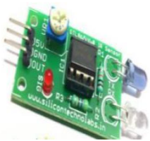
Fig 1: IR sensor

recording the elapsed time between the sound wave being generated and the sound wave bouncing back, it is possible to calculate the distance between the sonar sensor and the object(2).