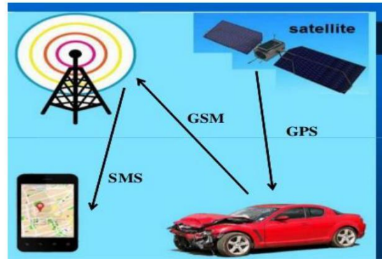
Fig 6: Report system