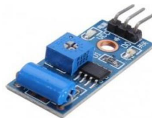
Fig 4: Vibration sensor