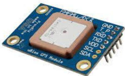
Fig 7: GPS Module