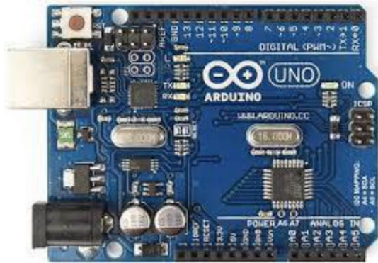
Fig 5: Arduino board