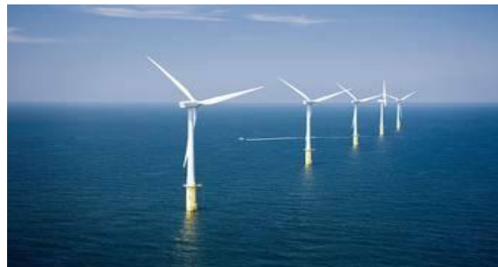
Fig.3: wind turbines near the sea.

Offshore energy is at the budding stage in India to extent its capacity to produce power. Off shore energy is a part of wind energy which is a renewable energy. As India is a peninsula and large country it has a large coastal line. MRNE has focused on offshore wind energy in the 21 th century to meet the power consumption needs. The costal line of India which has sea coast is 7600 kms.The progress of wind energy in India had started in 1986's itself.