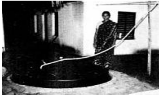
Fig.2: The first bio plant.