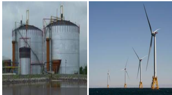
Fig.4. Biogas plant and Wind farm

These are the major obstacles faced during the installation and in the operating conditions of the biogas producer i.e. the digester and the offshore wind farms.