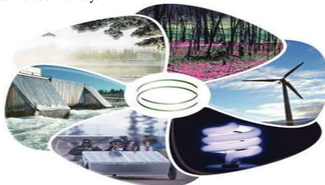
Fig.1 Renewable energies

Both the biogas and off shore potentials are renewable energy resources .Renewable energy means the energy which can be regenerated within certain period of time. There are many renewable energy resources like solar, geo thermal, wind and biomass etc... These are eco-friendly.