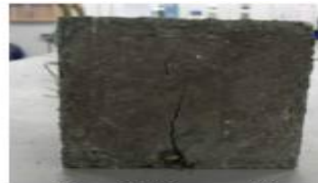
Fig. 7: Macro Fibre concrete after test

However, the tensile strength of the cube specimen was decreased for the sample T4 by 0.35 MPa compared to the cube specimen T1. The reason for this downward trend in the T4 cube (0.51% macro fibre volume cube) may be due to the inadequate concrete's workability (fibres are known to decrease workability) for higher dosages as well as full compaction not being achieved. It can be improved by a slight increase of fine aggregate, as this would provide a sufficient paste volume for coating the fibres and the addition of super plasticizer to offset the possible reduction in the slump, particularly for the mixtures with high fibre content.