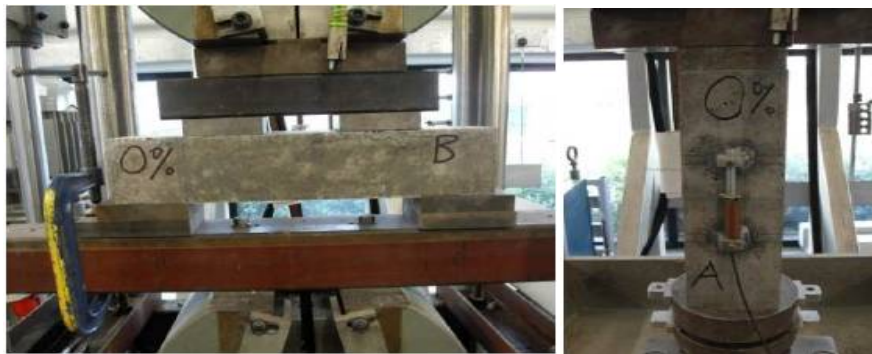
Fig: Instrumentation of beam specimen for direct shear test and Load vs. deformation test set up

An indirect tensile test procedure was carried out in accordance to BSI. The prepared cubes were instrumented and a failure load (P) was measured. The indirect tensile strength of concrete was calculated using the following equation, f_{ct} = \frac{2P \times 1000}{\pi cb} ; where, f_{ct} was the maximum tensile splitting strength (MPa), c and b were the sides of the cubes (mm).