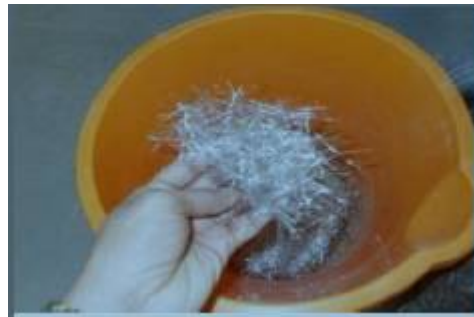
Fig: Macro synthetic fiber

The main component of the polymeric fiber used in this study was polypropylene. This synthetic macro fiber’s nominal length was 40 mm and had an aspect ratio of 90 and a specific gravity of approximately 0.92. The fiber had a rectangular cross section with average width of 1.4 mm and average thickness of 0.11 mm. The average tensile strength of the fiber was 620 MPa with a modulus of elasticity of 9500 MPa.