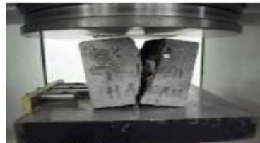
Fig. 6: Plain concrete after tensile test