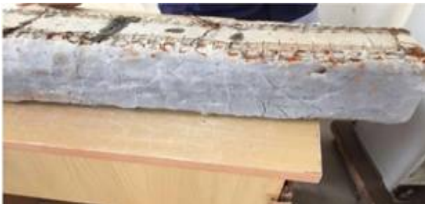
Fig. 9 Crack developed on Ferrocement after testing

The retrofitted beams were tested with the same procedure as adopted during the testing of control beams to calculate the ultimate load and the corresponding flexural strength. Fig (9), (10), (11) and (12) shows the crack developed on beams retrofitted with ferro cement, SIFCON, polypropylene and HFRC respectively after testing.