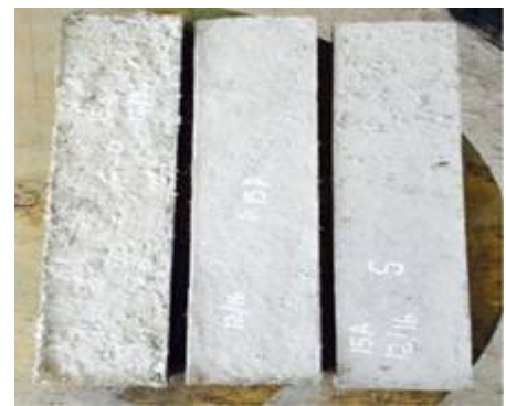
Fig.6 Casted Laminates.