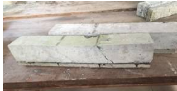
Fig. 10 Crack developed on beam retrofitted with SIFCON Laminate