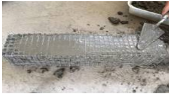
Fig .7 Applying mortar over wire mesh