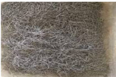
Fig.1 Crimped steel fibres

Polypropylene fibres are readily available in the market in the standard dimensions. Fiber of length 12mm with specific gravity 0.92 and density 930 kg/m 3 was used. The fibres used for the study is shown in Fig 2.