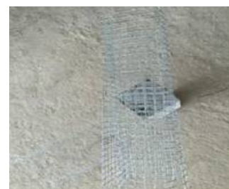
Fig.3 Square mesh