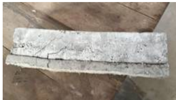
Fig .12 Crack developed on beam retrofitted with HFRC Laminate