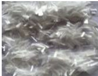
Fig.2 Polypropylene fibres