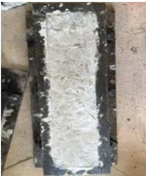
Fig. 4 Casted Beams

Polypropylene and HFRC laminates of size 50cmx10cmx2cm was also casted in the same way as SIFCON laminates. Polypropylene fibres were used instead of steel fibres in polypropylene laminates. In HFRC laminates both steel fibres and polypropylene fibres were mixed simultaneously in equal proportion. Finished laminates were kept for 28 days curing.