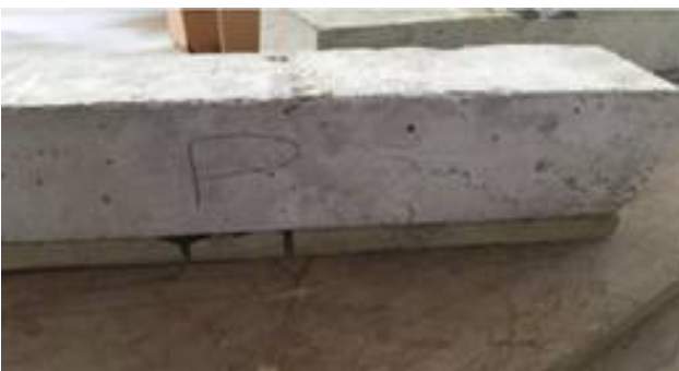
Fig.11 Crack developed on beam retrofitted with Polypropylene Laminate