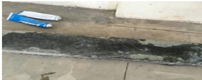
Fig.8 Araldite applied at the bottom face of distressed beam

After 28 days of curing all the laminates were bonded to the tension face of distressed beams using Araldite, a strong bonding agent. A bond line of 2.0mm thickness was kept constant for all specimens. After bonding leave the beams undisturbed for 7-14 days to ensure maximum bonding.