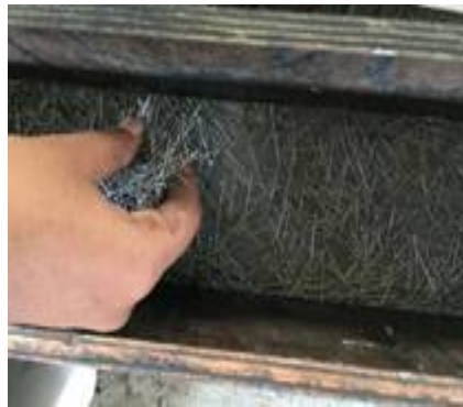
Fig.5 Placing steel fibers