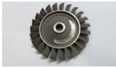
Fig 2:Turbine Wheel Figure