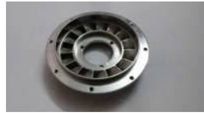
Fig 3: Nozzle Guide Vane