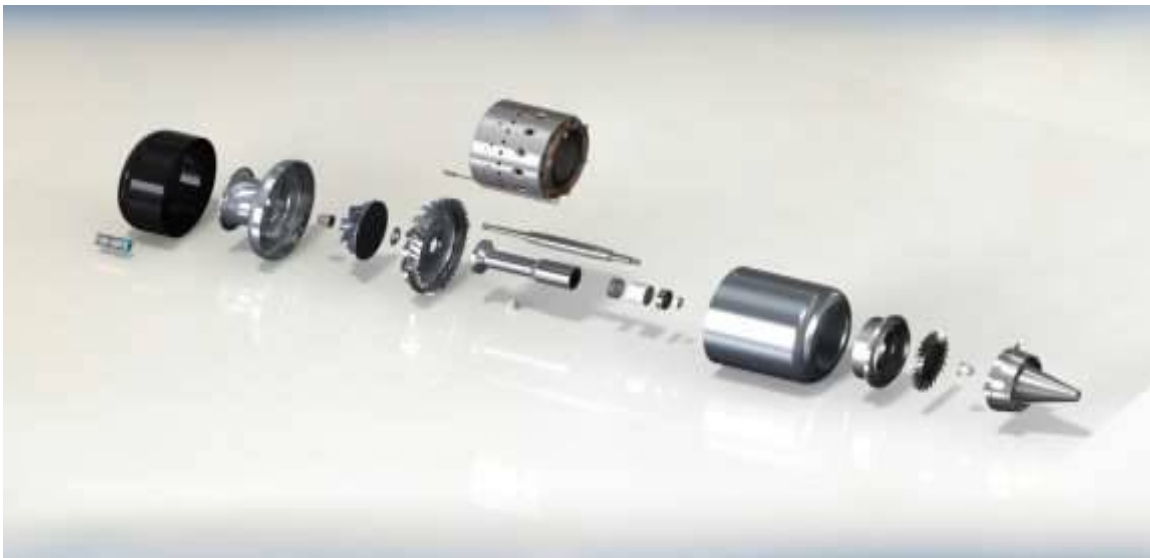
Fig 12:Parts of the engine

The assembly of the parts are as follows. The compressor and the turbine are connected to the shaft and rotates with it. The shaft is supported on bearings which fit neatly into the shaft tunnel. The tunnel is attached to the diffuser at the inlet and to the nozzle guide vane at the exit end. The diffuser is in turn attached to the housing by means of screws. The compressor cover protecting the compressor is attached to the housing. At the exit end the shaft tunnel is attached to the NGV which in turn is connected to the housing and the exhaust nozzle. Sufficient clearance is given between the rotary components(0.5mm- 1mm) to ensure smooth operation.