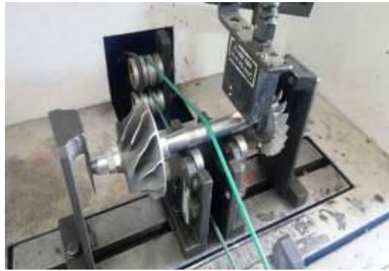
Fig17:Balancing of rotor assembly