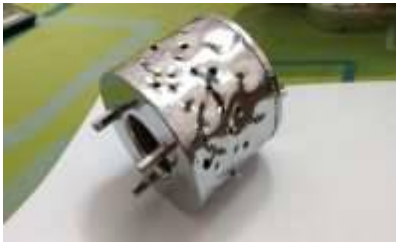
Fig 4: Internal Combustion Chamber