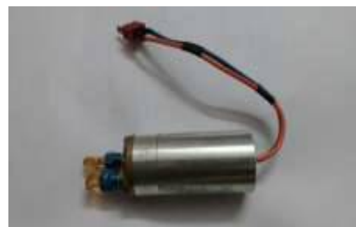
Fig 8:Fuel Pump