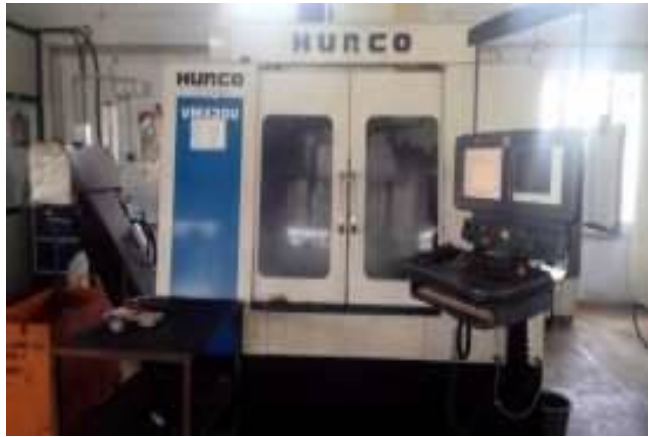
Fig 11:5 Axis CNC Lathe

Hard to manufacture parts requiring high degree of accuracy were imported. They are a)Compressor b)Turbine c)Nozzle guide vane All the rest of the parts were manufactured indigenously. The machine used for this purpose was a 5 axis CNC machine HURCO VMX30U.