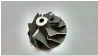
Fig 1: Compressor Wheel

k)Housing l)Compressor cover m)Spring n)Nuts and bolts