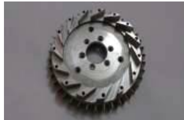
Fig 5: Diffuser