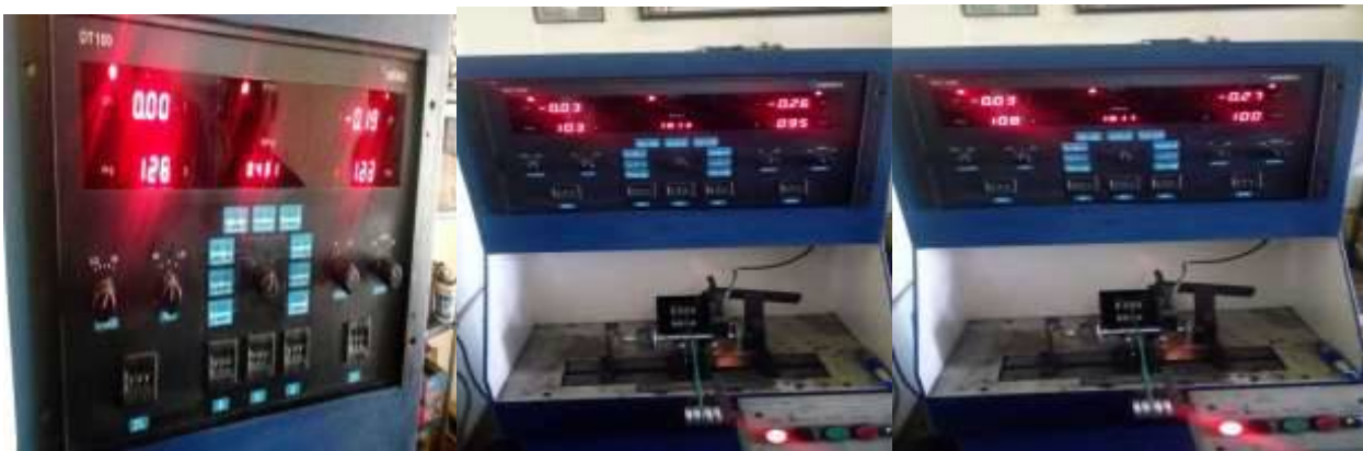
Fig 14,15,16: Dynamic balancing machine

The components were balanced by rectifying the positioning of the spacer rings, compressor wheel and that of the turbine wheel also taking into consideration at what degree the parts are to be assembled on the shaft.