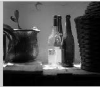
(D) BRISQUE =0.9010