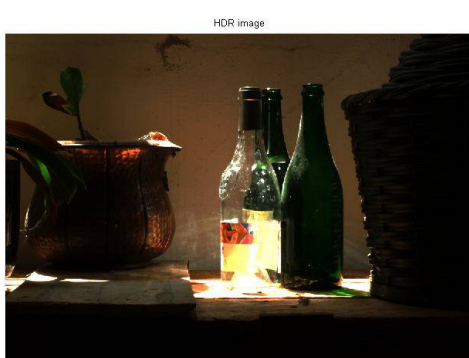
(A) HDR IMAGE

Input image is divided into R-channel, G-channel and B-channel. Then Tone Mapping is performed in each channel separately and preprocessed image is obtained by combining these three channels.