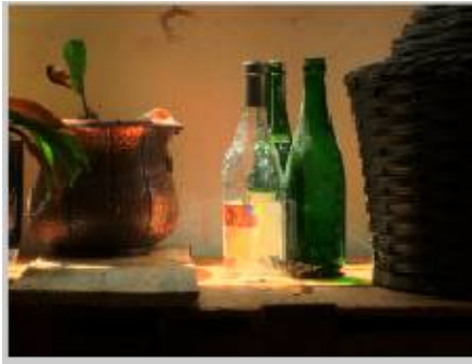
Reinhard TMO (A)TMQI=0.9987