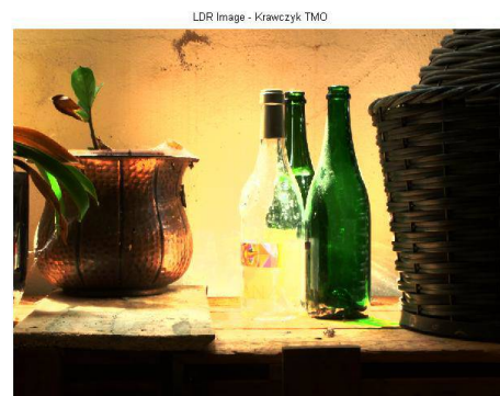
(B) LDR IMAGE