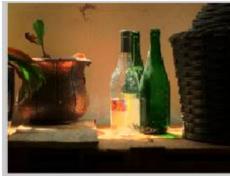
Logarithmic TMO (C)BLIND-I=0.921