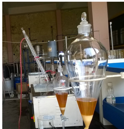
Figure 2: Experimental setup for transesterification

A laboratory scale biodiesel reactor was setup, see figure 2. It mainly consist of three necked 2000ml round bottom flask. A reflux condenser, thermometer and mechanical stirrer was attached to the round bottom flask. The temperature of the oil inside the flask was digitally controlled by the water bath. The reflux condenser is provided in order to recover the methanol that evaporates during the reaction. After the trans-esterification reaction a separating funnel was used for separating the biodiesel and glycerol.