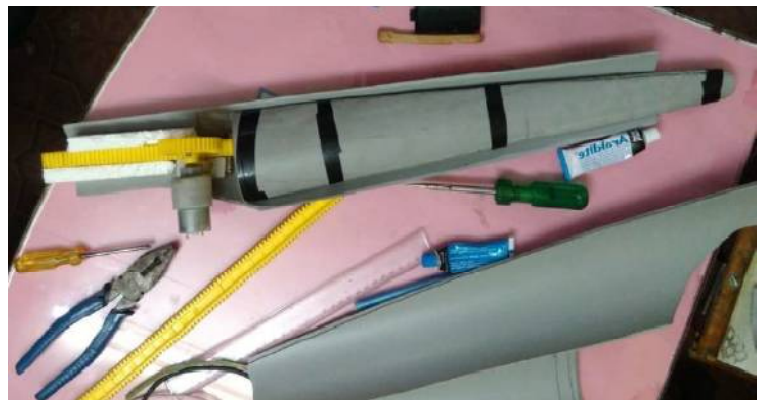
Fig 3: Blades after Fixing Mechanism