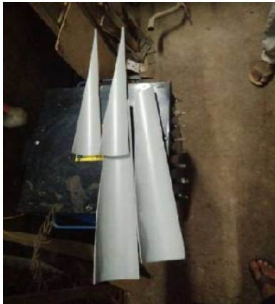
Fig 2: After Cutting PVC Pipes