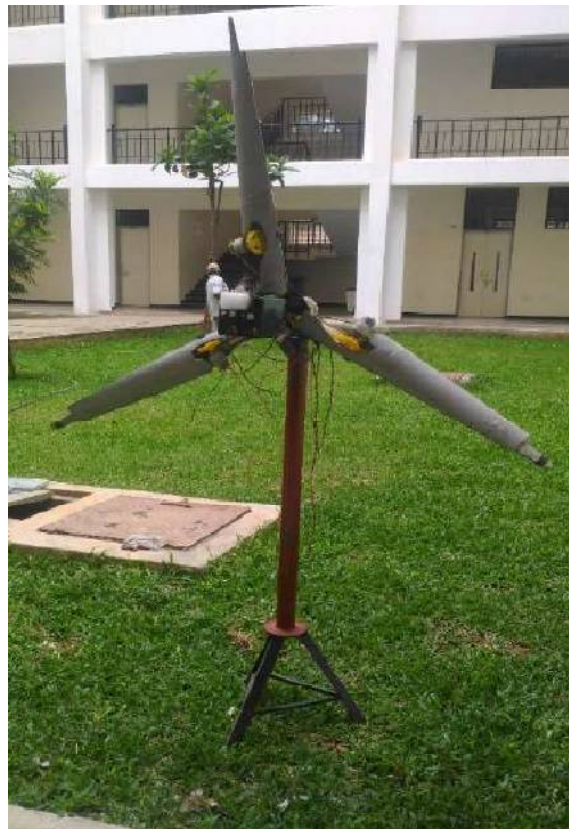
Fig 4: Working Prototype