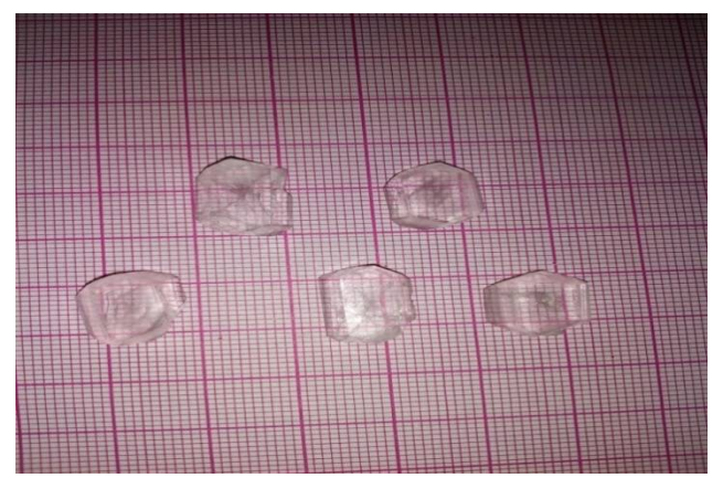
Figure 4.1: Grown L-Alanine doped strontium formate dihydrate crystal

The optimum temperature for the growth of L-Alanine doped strontium formate dihydrate crystals was found to be 40 °C. Crystals of good quality and transparency appeared below the beaker in about 48 hours and grew in large crystals in about 7-8 days. The largest crystal was about 8 mm in length. It is observed that as the size of the crystal increases the transparency was reduced. The photograph of the grown crystals was displayed in fig.4.1.