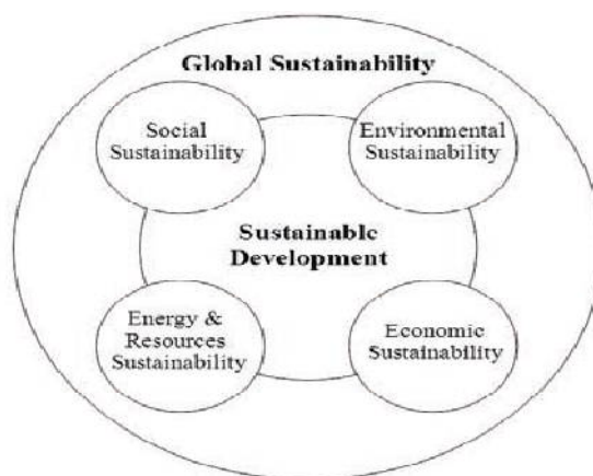
Fig1. Four key factors of sustainable development under global sustainability

Fuel cell technology is clean, quiet, and flexible one and is already beginning to serve humanity in variety of useful ways. Nevertheless, production volume is low and costs are too high public support is needed to help generate initial demand this cycle.