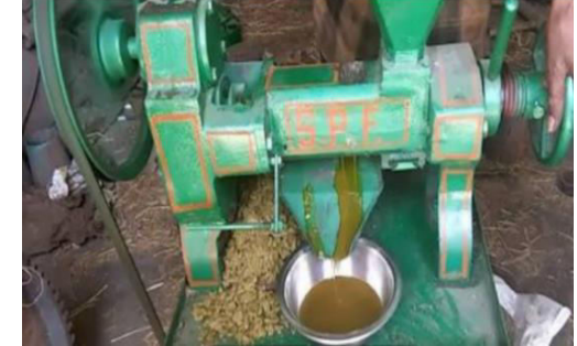
Fig 2: Extraction of algae oil from mini oil expeller.

The samples were spread under the sun in an open area for 24 hours to evaporate the moisture present in it. The algae sample were collected was about 40kg, when it was dried it became 30kg. The dried algae were put into the mini oil expeller (as shown in fig 2). The oil was obtained about 500ml.