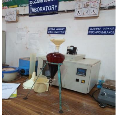
Fig 4: Separation of biodiesel and glycerine.