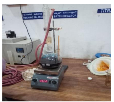
Fig 3: Oil heating in 3-neck flask.