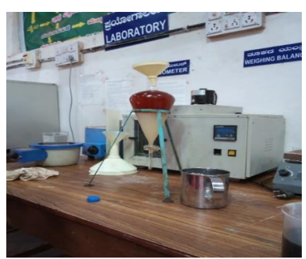
Fig 5: Washing of Biodiesel with water.