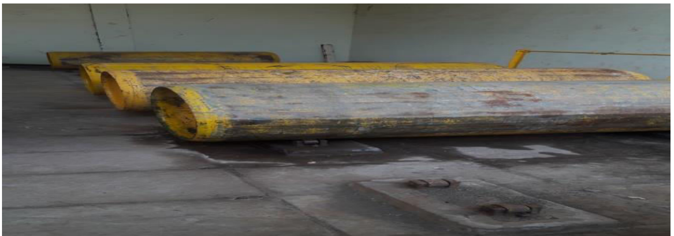
Figure 4 Chlorine Cylinder Use for Disinfection Process.

Filtration Unit: During this process the water enters through upper valve, moves down towards the filter bed, after passing through filter bed and underdrainage system it flows out through lower valve. The unit used to measure the filtration rate is inflow rate ( m^3/hr ) divided by filtration area ( m^2 ).