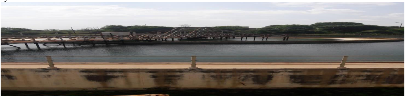
Figure 3 Sedimentation Tank

Clariflocculator Unit: This is the third treatment process. In this process as the water contains negatively charged particles whose amount of charge is been calculated and same amount of positively charged particles are added to water which results in the formation of large molecules of positive and negative charge particles due to process of attraction and these particles then settled down in sedimentation zone under the action of gravity. From these zones these particles are easily removed.