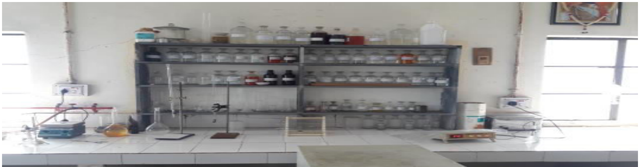
Figure 1 Laboratory of Water Treatment Plant Jalgaon

Aeration Unit: After the laboratory test is being conducted the water is send to the aeration unit where the oxygen level of the water is been increased and the other gases are emitted out in the atmosphere. The Cascade type aerator is used in most of the water treatment plant and even in Jalgaon Water Treatment plant.