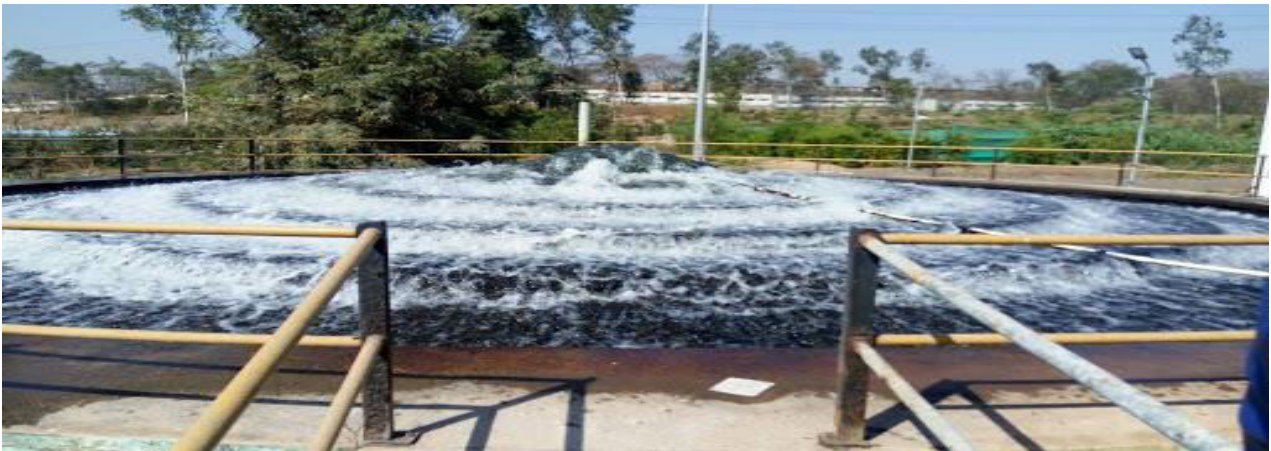
Figure 2 Cascade Aerator

Aeration Unit: After the laboratory test is being conducted the water is send to the aeration unit where the oxygen level of the water is been increased and the other gases are emitted out in the atmosphere. The Cascade type aerator is used in most of the water treatment plant and even in Jalgaon Water Treatment plant.