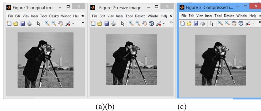
Figure 2: Multi-level BTC Algorithm applied on Cameraman Image of block size 4×4

Figure 2; show the Cameraman image of 4×4 block pixel. In this figure 2 (a) show the random image of the Cameraman image and resize the image of the 256×256 in the dog image show in figure 2 (b). The compressed image is 4×4 block pixel of Cameraman image shown in figure 2 (c) respectively.