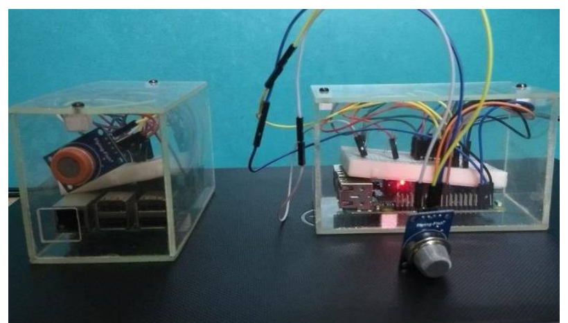
Fig. 2. Integration of Embedded Device and Sensor.

Prototype Description (Fig 2): This is prototype of real time PollutionMonitoringSystem. This prototype consists of integration of all the components i.e. Raspberry pi, MQ-135 Gas Sensor, Bread board, Jumping wires, ADC converter.