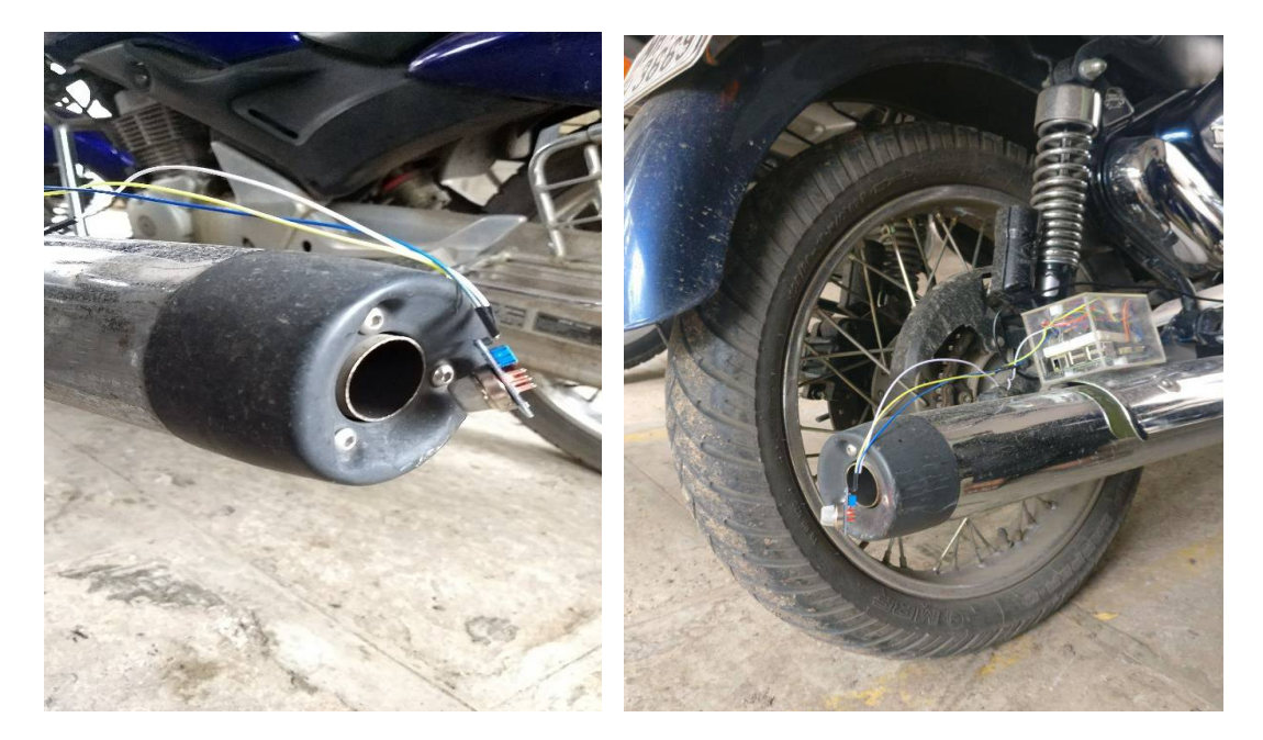
Fig. 3 Prototype Validation

(A High Impact Factor, Monthly, Peer Reviewed Journal) Visit: <u>www.ijirset.com</u> Vol. 7, Issue 4, April 2018