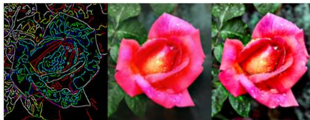
Fig(4):Final Detail Enhanced output of the proposed algorithm.

The magnified edge patterns of the test image are properly amalgamated with the test image and then an adaptive edge preserving filter is brought into the operation on the edge magnified test image to improve and enhance its details thereby improving the visual resolution. The output of the edge preserving filter is shown in figure (3).