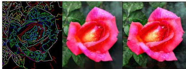
Fig(3):Edge preserving Filter Output.

The magnified edge patterns of the test image are properly amalgamated with the test image and then an adaptive edge preserving filter is brought into the operation on the edge magnified test image to improve and enhance its details thereby improving the visual resolution. The output of the edge preserving filter is shown in figure (3).