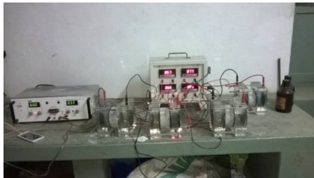
Figure 2. Experimental setup of rapid chloride penetration test