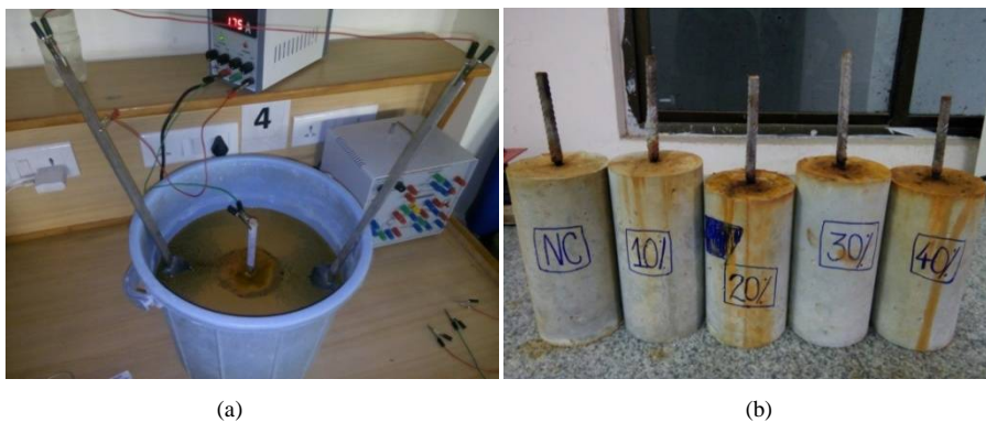
Figure 1. Corrosion test (a) Experimental setup (b) Specimens for the test