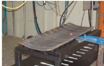
Fig.4 Amid test of LBF

LBF has been a conceivable method for the forming of metallic, plastic and composite materials and presently utilized in fast model and arrangement. Tests delivered amid test LBF are appeared in Fig. 4.