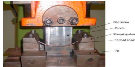
Fig.2 Mechanical Framing

Is the stream graph of the part of the assembling business in a maintainable framework. A basic photograph of mechanical framing of sheet is appeared in Fig. 2.