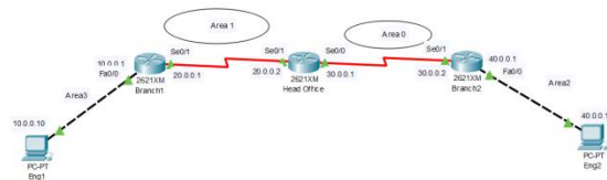
Figure 1: Network model configuration diagram implemented with Packet Tracer Simulation software

Routing protocols should be very well planned and dimensioned for each type of network. They are used according to the choices of the network administrator. The advantage of the routing protocols consists of the fact that they converge very quickly, even though the main route disappears, meaning that these protocols are auto adaptive. Table 2 is showing types & quantities of devices requirement for develop a network model. In this network we are considering three routers with different area & hostname. Branch1 hostname has been assigned to router 1 & Head Office has been assigned to the router 2 & Branch2 is assigned Router 3. Branch 1 & 2 have one engineer with PC, Eng1 assigned in branch1 & Wng2 assigned in branch2. Each component of network requires 32-bit IP address so that it can communicate with other devices. In below table it has been assigned IP to each device.