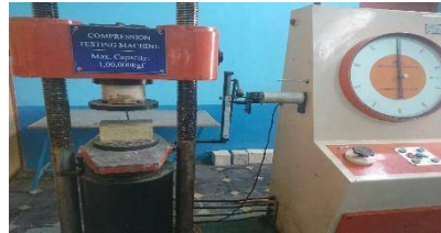
Table 5.2: Test Results of Compressive strength