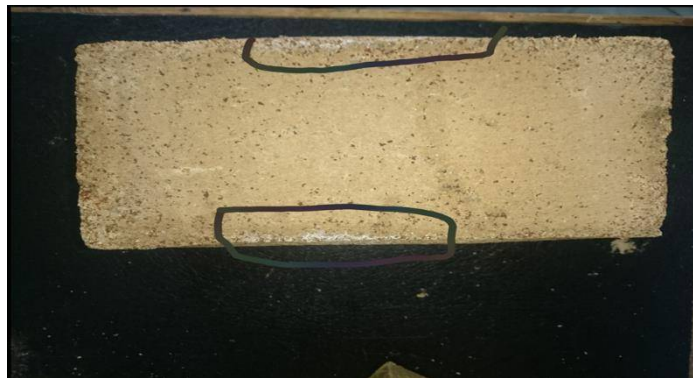
Fig 5.7 Efflorescence Test on Bricks

From the results of efflorescence test, the bricks specimens of B1, B2, and B3 have a thin deposit of salts covered over exposed area of the specimen is less than 10%.