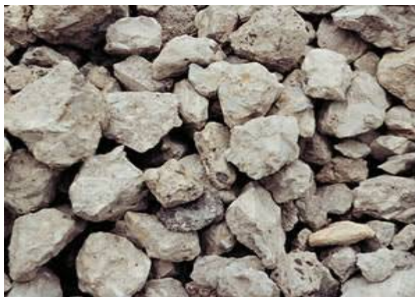
Figure 2.1 Demolished concrete (RCA)