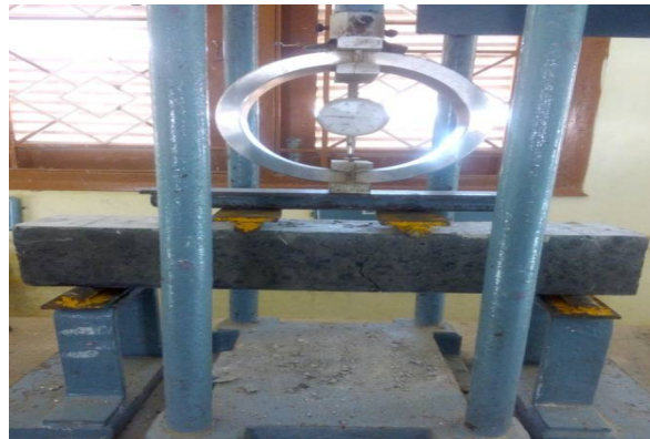
Fig 4.2 Test Set Up for Flexural Strength

The flexural strength represents the highest stress experienced within the material at its moment of rupture. It is measured in terms of stress, here given the symbol f_{cr} . The flexural strengths of the respective specimens have been obtained from the flexural tests performed on the prism specimens of size 100mm x 100mm x 500mm. The flexural strength are tested using a two point loading frame machine as per standard as shown in figure 5.2.