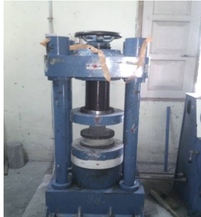
Fig 4.1 Test Set up for Compressive Strength Test