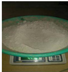
Fig 2.5 Flyash

Ordinary class F flyash of cementitious property collected from the nearer thermal power plant of specific gravity 2.2 is taken. The quality parameters of flyash for use in concrete confirming to IS 3812 (part I) has been used.