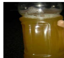
Fig 2.6 Bacillus subtilis

Bacillus subtilis a model laboratory soil bacterium is cultured. The pure culture is maintained constantly on nutrient agar slants. It forms irregular dry white colonies on nutrient agar. Whenever required a single colony of the culture is inoculated into nutrient both of 200ml in 500ml conical flask and the growth conditions are maintained at 37degree temperature and placed in 125rpm orbital shaker. The medium composition required for growth of culture is peptone, nacl, yeast extract.