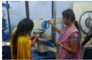
Fig 4.2 Flexural strength test