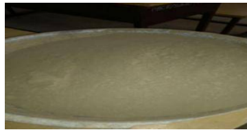
Fig 2.1 Cement

Ordinary Portland cement (OPC) is by far the most important type of cement. The OPC was classified into three grades, namely 33grade, 43grade, 53grade depending upon the strength of the cement at 28 days tested as per IS4031-1998. If the 28days Strength is not less than 33N/mm 2 , 43N/mm 2 and 53N/mm 2 it is called 33grade, 43grade, 53grade cement respectively. OPC of 33grade from JSW brand conforming to IS 269 is used in this experimental work.