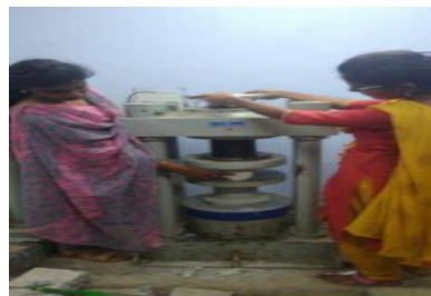
Fig 4.3 Split tensile strength test

The splitting strength of the conventional concrete specimens are to be compared with that of the specimens made with added of above said percentage of flyash and bacterial solution. The test was conducted as per IS 5816:1999. The specimens were kept in water for curing for 28 days and on removal were tested in wet condition by wiping water. Central line was drawn on the two opposite faces so as to ensure that lines are in the same axial plane. Care was taken so that the upper platen with the lower platen. The load is applied without shock and increased continuously at a nominal rate within the 1.2\text{N/mm}^2/\text{min} until failure. The failure load of tensile strength of cylinder is calculated by using the formula, Tensile strength = \frac{2P}{3.14 d^2} Where, P = Failure load of the specimen, D = Diameter of the specimen, L = Length of the specimen