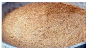
Fig 2.2 Fine aggregate

The aggregate size is lesser than 4.75mm is considered as fine aggregate. The sand particle should be free from any clay or inorganic materials and found to be hard and durable. Silt test is carried out to specify the limits of presence of organic matter and silt in fine aggregates. It was stored in open space free from dust and water. In our experiment fine aggregate are found from bed of river. It conforms to IS 383-1970 Comes under zone II. River sand passing through 4.5mm sieve and retained on 60 micron sieve is used and will be tested as per IS 2386(part I)-1963. The fineness modulus of sand is 5.57% with specific gravity of 2.65.