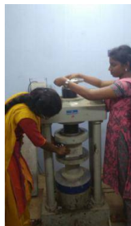
Fig 4.1 Compressive strength test