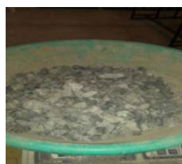
Fig 2.3 Coarse aggregate