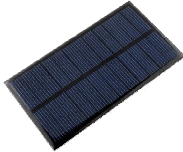
Figure 1 Solar Panel

Output Current – 500 mA Dimensions – 136 x 72 x 2 (in mm)