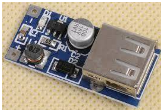
Figure 2 dc to dc Convertor Amplifier

An Integrated Back Cover: - Mobile Back Cover is used to support solar panel and also give protection to the sides and edges of mobile phone. They are basically used to provide safety to the mobile phones.