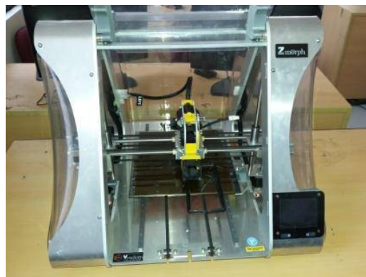
Figure 4 3D Printer

3D Printing: -It is a technique used to manufacture 3D objects in which layers of material are formed under computer control to create an object. Objects can be of almost any shape or geometry and typically are produced using digital model data from a 3D model or another electronic data source such as an Additive Manufacturing File (AMF) file. (Evans B. [5])