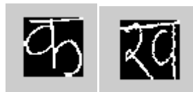
Fig5. Segmented Characters