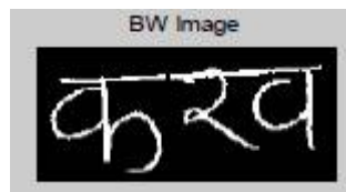
Fig4. Binary/Threshold Image