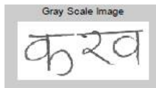
Fig3. Grayscale Image