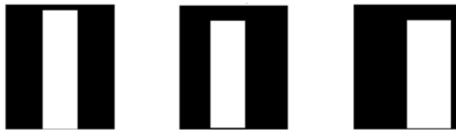
Fig.4: Ear specific square masks

The results of this method are as follows: