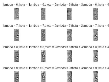
Fig.12: Imaginary parts of gabor filtered image

The mean, standard deviation, entropy, x and y coordinates of the largest area components of the binarized form of the real and the imaginary parts of the gabor filtered image are used as features for classification. These features are given to KNN classifier and SVM classifier. The system is tested on images of 31 persons of IIT Delhi ear database. The accuracy found using KNN classifier is 87.09% and that with SVM classifier is 90.32%.