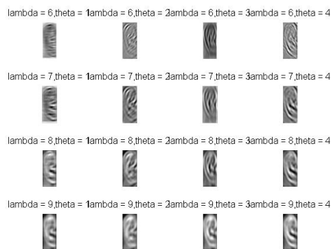
Fig.11: Real parts of gabor filtered image

The real parts of gabor filtered image are as follows for different values of lamda and theta.