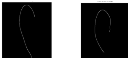
Fig.3: Largest edges detected images