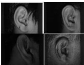
Fig.2: Images in IIT Delhi ear biometrics database

The first step in the system is image acquisition. The ear images are acquired from the IIT Delhi ear biometric database. Some of the images of the ear biometric database are as follows: