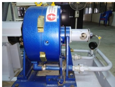
Figure 2: dynamometer setup in test rig

The measurement of engine Brake Power (BP) involves determination of the torque and angular speed of the engine output shaft. This torque-measuring device is called a dynamometer. The engine was clamped on a test bed and the shaft is connected with the help of propeller shaft to an eddy current dynamometer for loading the engine. Eddy current dynamometer consists of a stator and a rotor disc and it is coupled to the output shaft of the engine. On stator a number of electromagnets are fitted. When rotor rotates eddy currents are produced in the stator due to magnetic flux set up by the passage of field current in the electromagnets. These eddy currents oppose the rotor motion, thus loading the engine. These eddy currents are dissipated in producing heat so that this type of dynamometer needs cooling arrangement. A moment arm measures the torque. Engine load was controlled by varying excitation current to the eddy current dynamometer using dynamometer controller.