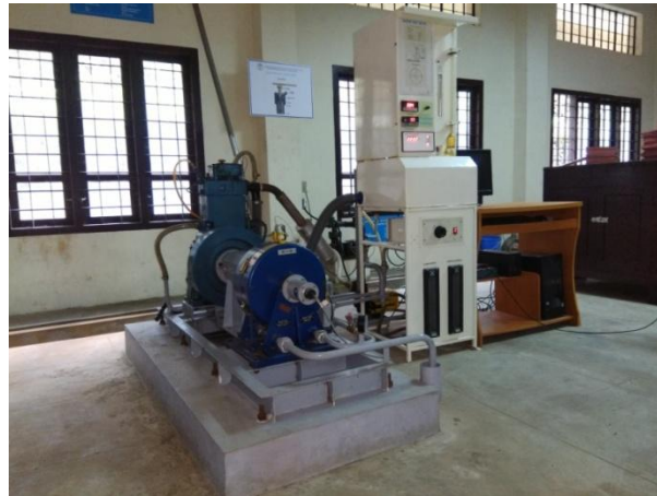
Figure 1: Overall view of experimental test rig