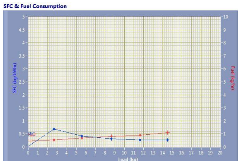
Fig 5. Load Vs SFC, TFC

The Fig 4 shows that the Indicated and brake thermal efficiency of engine with load. When load increases the brake thermal efficiency increases but Indicated thermal efficiency decreases. When load increases the amount of fuel accumulated within the combustion chamber are also increases with respect to that the indicated thermal efficiency decreases. When input power increases the power generated in the output shaft also increases then brake thermal efficiency also increases.