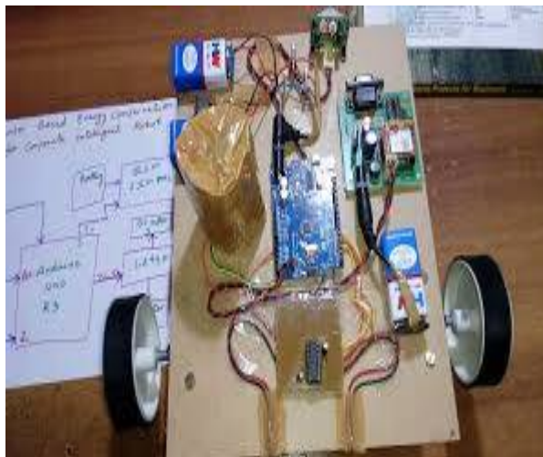
In Fig.2. In this project we use this hardware description to controlled Metal and Gas Detection Robot by using protocol.