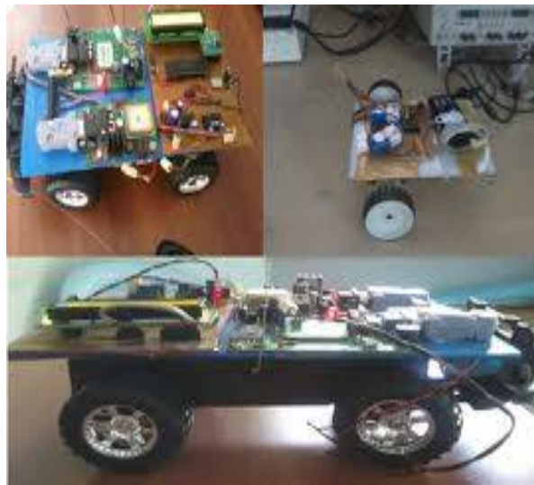
In Fig.1 Protocol of Metal Detecting Robot.