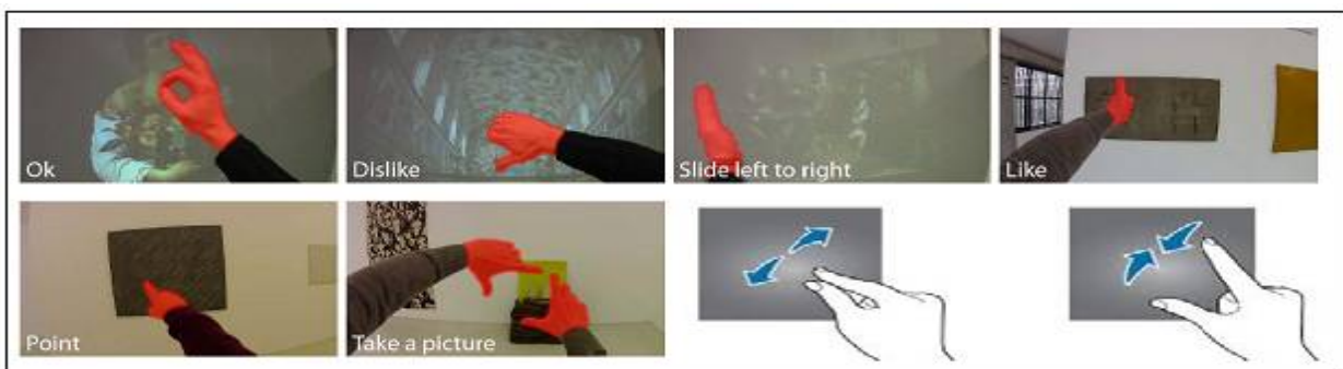
Fig 1: shows the different hand gestures which are given to the system to build the trained data set

In this we are proposing a semi-supervised action recognition for the touch less touch screen. Here the system is trained with the datasets. The trained dataset contains various labeled and unlabeled videos of various actions, action such has scrolling down which is represented by top to down action which is done by an hand, pen, pencil or any other stick, similarly left scrolling, right scrolling, down scrolling, up scrolling, zoom in, zoom out, increasing and decreasing of volume or brightness etc. is given as a trained dataset (fig.1). The action done by the users are recognized by the separate web camera. Here the usage of sensor is been eliminated. The actions which are being done by the users are recognized and compared with the trained dataset. This is done by extracting the features of both the action given by the user and that of the dataset respectively. Feature are extracted by SURF (speeded up robust features). The extracted features are been compared by PROSAC (progressive sample consensces).