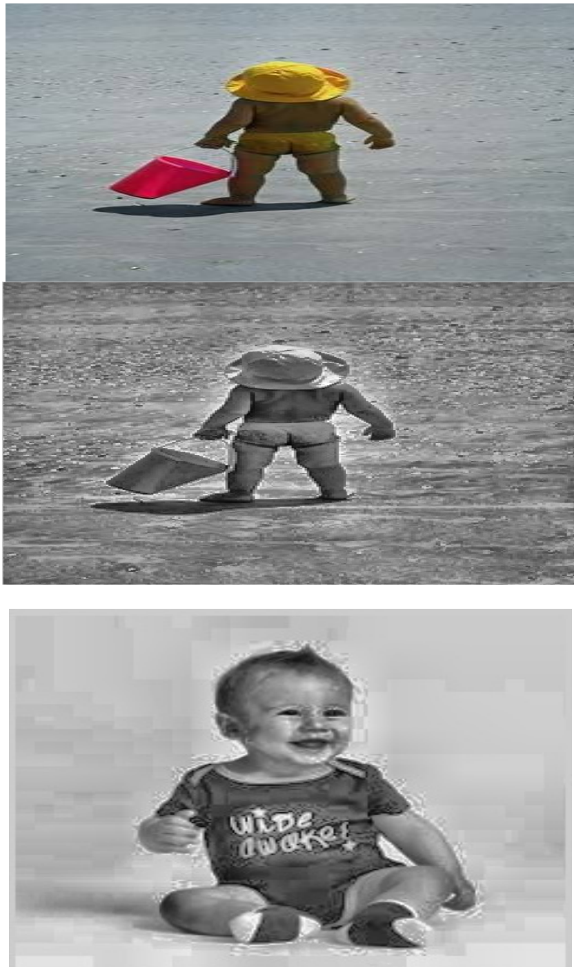
Figure. Result after obtaining the contrast value