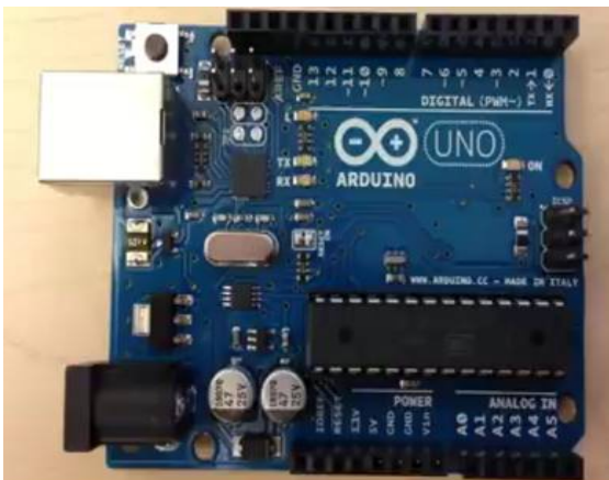
Fig.4.3 Arduino Board