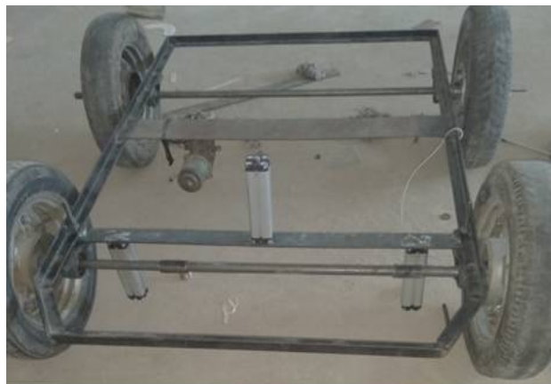
Fig.4.4 Chassis setup