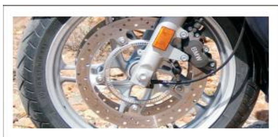
Fig.ABS of BMW Bike