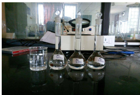
Fig 2: Standard Lead Solutions

Three standard solutions of known concentrations were prepared from a stock solution of \text{Pb}(\text{NO}_3)_2 (1.598g \text{Pb}(\text{NO}_3)_2/1000\text{ml} ). The concentrations of these three solutions were 3ppm, 5ppm and 7ppm (Fig 2).