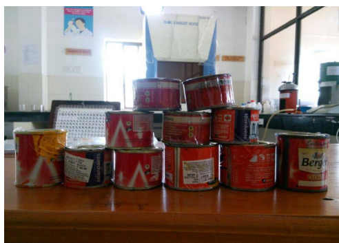
Fig 1: Paint samples

The figure shows the paint samples selected for the analysis of different manufacturers and colours.