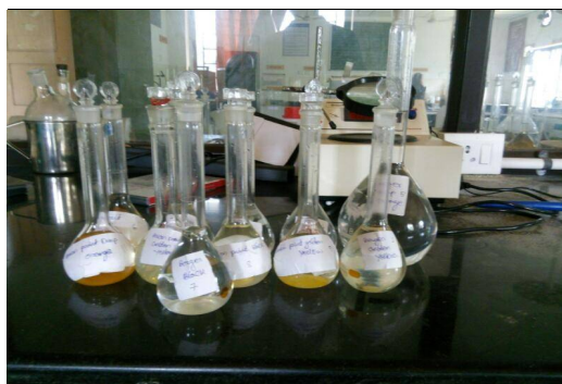
Fig 3: Diluted Paint Samples

The figure shows the diluted paint samples. The concentrated nitric acid dissolved paint solution is diluted using distilled water for comparison with the standard solutions in the AAS.