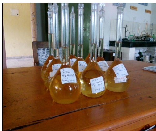
Fig 4: Diluted soil samples

Soil samples were screened to remove unwanted debris. Soil samples were dried in petri dishes in an oven at 70 – 80°C for several hours. 10gm of dried soil is taken in a beaker and then digested using 10ml of aqua-regia( \text{HNO}_3:\text{HCl} , 1:3). Samples were then filtered and quantitatively transferred to volumetric flask and made up with distilled water to a total volume of 250ml (Fig 4).