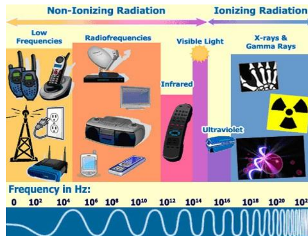
Figure 1: diverse uses of electromagnetic radiation

The rapidly evolving mobile phone technology raised public concern about the possibility of associate adverse health effects. The telecom sector is providing millions of jobs in the world but it is also giving cancer and other serious health problem to billions of people besides causing harm to birds, animals, plants etc. to the living world. It is not only fastest growing industry but it is also creating fastest growing health problems. Many people are increasingly concerned about the possible health effects due to frequent, long term use of cell phone and the radiation. As year after year immense numbers of users of mobile phones, even small adverse effects on health could have major public health implication. Traffic accidents caused by using telephone during driving are another public challenge. Mobile phones are often prohibited in hospitals and on airplanes, as the radiofrequency signals may interfere with certain electro-medical devices and navigation systems. In addition to the context of Nepal, as six voice telecom operators, more than 30 ISPs, more than 320 FM stations, more than 35 Television channels and one AM radio are already in operation, it is already high time to explore the signal level and develop the guidelines to minimize the health hazard from the electromagnetic radiation of wireless communication.