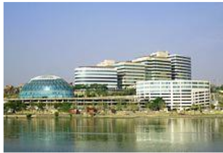
Hyderabad is a major IT services centre

portfolio inflows. From April 2016 to January 2017, RBI data showed that, for the first time since 1991, India was funding its deficit through foreign direct investment inflows. The Economic Times noted that the development was "a sign of rising confidence among long-term investors in Prime Minister Narendra Modi's ability to strengthen the country's economic foundation for sustained growth".[9]