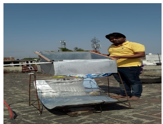
Figure.2 Arrangement of Still