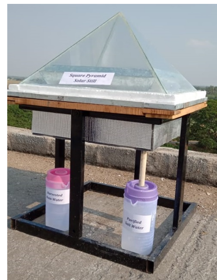
Fig 2: Actual Image of Experimental Kit