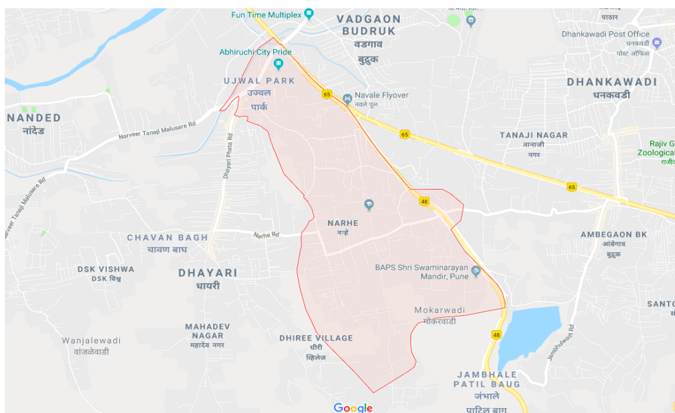
Map 1: Area taken under consideration

Narhe is a suburb of Pune, Maharashtra, India. It is approximately 11 kilometers from Pune. The Figure given below shows the study area, i.e. Narhe which is also mentioned as Narhegaon.