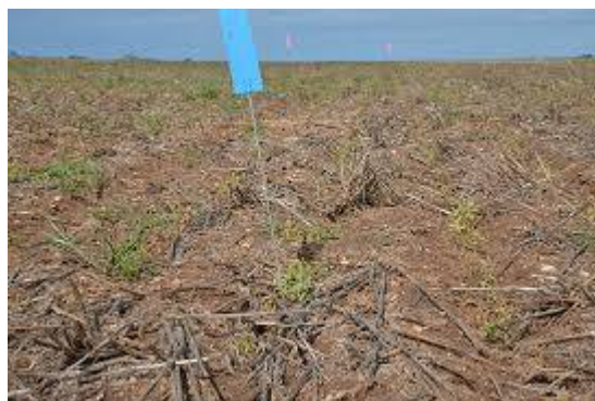
Fig. burnt plants after using more pesticides.( ref no . 1)

The regular condition of soil is sandy and the silt is maximum so that the soil water holding capacity is too poor. Those effects on the quality of decreasing in the physical and chemical properties therefore the physic-chemical analysis is necessary because of that the current condition is define and the quality should help to decide the supplements. The use of chemical fertilizer is increasing that makes the soil infertile because of that chemical fertilizer the toxic chemicals are remains in the soil properties that again goes in the plants which may harm the human body. in this paper they did the analysis in which they includes the testing of pH EC ,organic carbon , total nitrogen , phosphorous , potassium and with this the particle size distribution results are done in that there are mainly rocky soil is present the rocks are large , silt is intermediate , and clay is very fine . This paper gives me the idea about the total types of soil available in the yavatmal district .